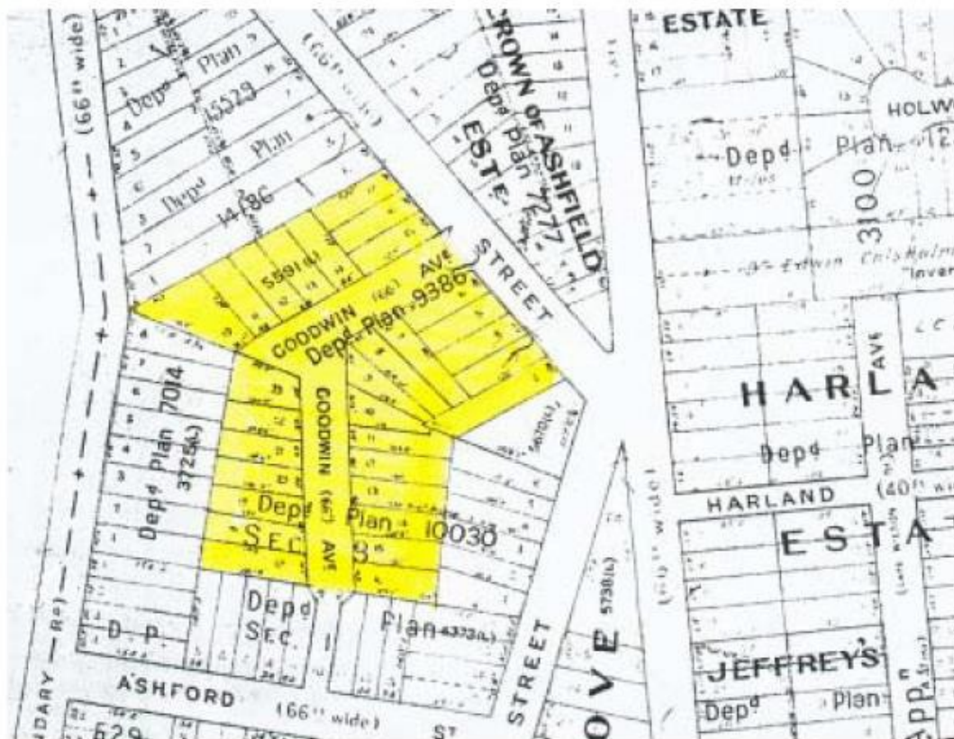
Above: An extract from the H C E Robinson map of Ashfield South Ward, compiled in about 1912 and progressively updated. At this time this part of Ashfield was in the East Ward. Note the two unnamed subdivisions, shown by their deposited plan numbers. The oblique line separating the two is clearly shown. Goodwin Avenue, short and angled, is yet generously wide. One of the Ashford Street allotments was used to provide a narrow access from the south